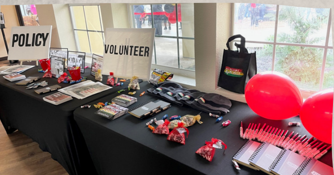
The Afiya Center celebrated its grand opening on October 29, 2022

The Afiya Center (TAC) was established in response to the increasing disparities between HIV incidences worldwide and the extraordinary prevalence of HIV among Black womxn and girls in Texas. TAC is unique in that it is the only Reproductive Justice (RJ) organization in North Texas founded and directed by Black womxn. At TAC we are transforming the lives, health, and overall wellbeing of Black womxn and girls by providing refuge, education, and resources; we act to ignite the communal voices of Black womxn resulting in our full achievement of reproductive freedom.